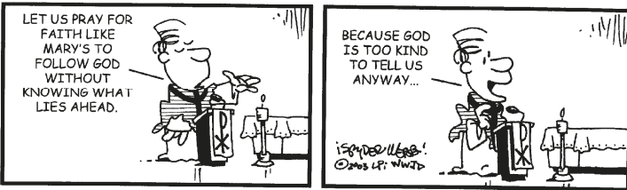
MARY, MOTHER OF GOD

The Parish Office will be closed this Monday, January 2, 2012.