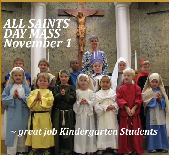
ALL SAINTS DAY MASS November 1